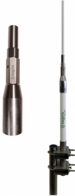
Racor inoxidable Stainless fitting Raccord inoxydable