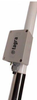
Box BOX HF-1 (not included)