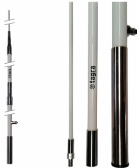
Three assembly sections (3 x 3 meters)