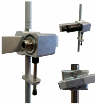
Support and connector view