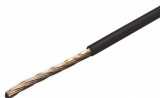
Cobre 19 x 0,29 mm Copper 19 x 0,29 mm Cuivre 19 x 0,29 mm

Includes: JA-200 This kit antenna include two 41,20 methers cables, two wires isolators ISO-HF and JA-200 1:6 Made of copper wire with plastic insulation. Length first section 27.58 methers and second section with 13.79 methers.