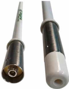
Tube and support in INOX