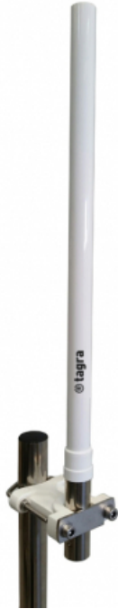
Tube and support in INOX