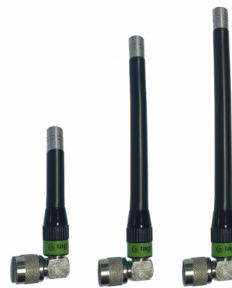
Different models available