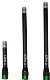
Different models available