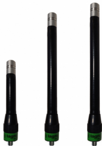
Different models available