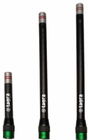
Different models available