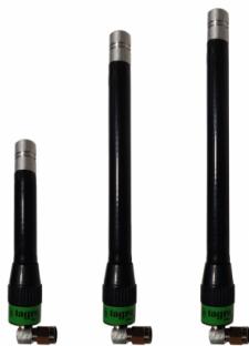
Different models available