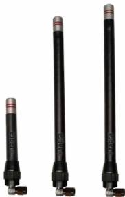
Different models available