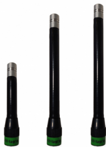
Different models available