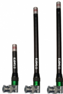
Different models available