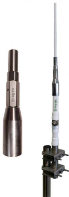
Racor inoxidable Stainless fitting Raccord inoxydable